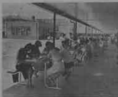
Eating lunch in the new patio area and listening to the popular songs played on the juke box are these students in sixth period lunch.