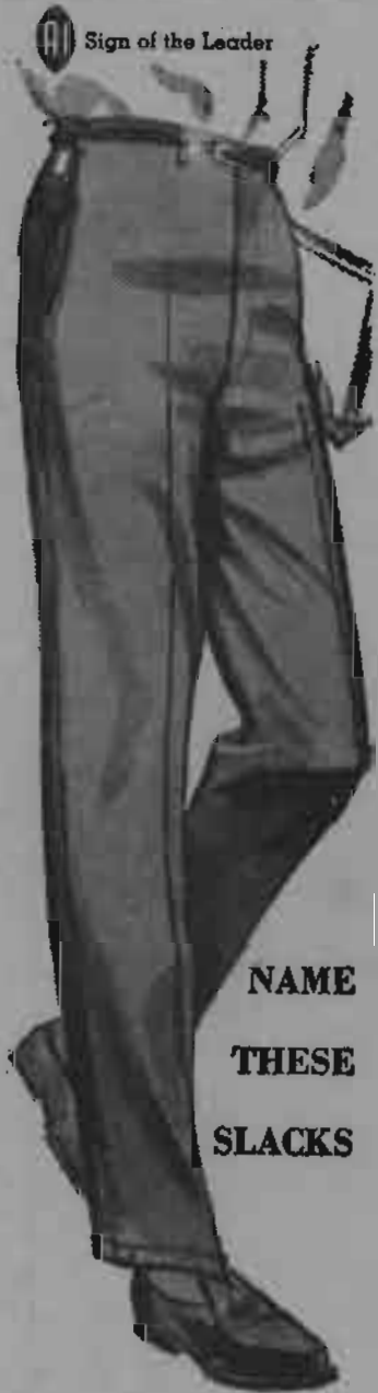
NAME THESE SLACKS